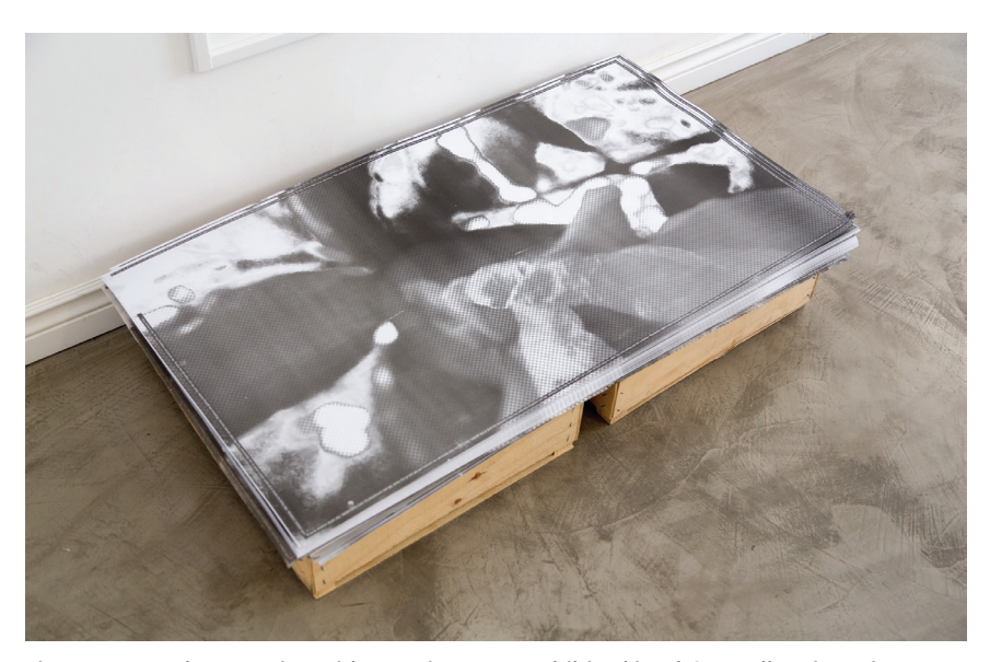
Figure 12. Garden Exercises Video. Quito. 2017. Exhibited in Khôra Gallery in Quito, 2017.

Garden Exercises, presented in Khôra gallery in Quito as part of Bosques (húmedos) Tropicales exhibition, was accompanied by posters with a text (mentioned earlier 'phenomenological writing'), which were integral part of the work. The same piece presented in Spain in BilbaoArte Artistic Production Centre as part of Parallel Dimensions exhibition was put in a context of a different art work with which it functioned in a way of a contrast. Our video was a recording taken in a specific geographical and cultural site (a sensuous geography of a garden in Quito), whereas the creation exhibited next to it was a mechanical live-feed filming piece (in BilbaoArte space). This very same Garden Exercises has just been accepted as a short film (compilation of three videos) to Jihlava International Documentary Film Festival in Czechia, where it will function without the art gallery context, in section of experimental filming. This will set for Garden Exercises a situation of a cinematic black box. post(s)