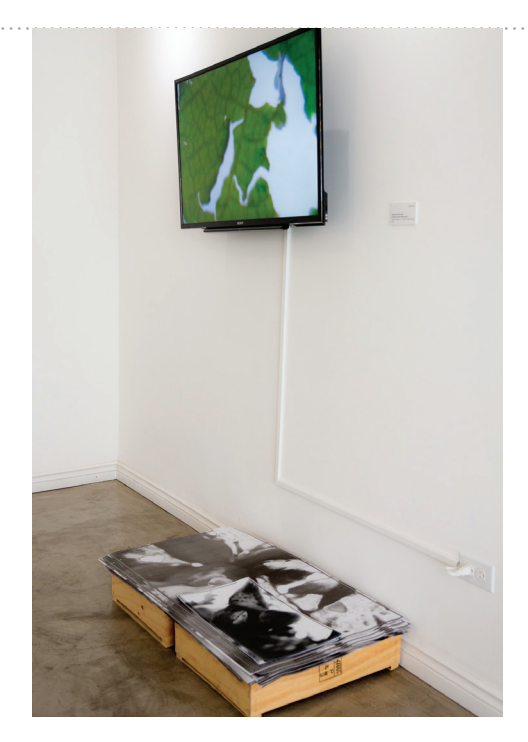
Figure 13. Garden Exercises Video. Quito. 2017. Exhibited in Khôra Gallery in Quito, 2017.