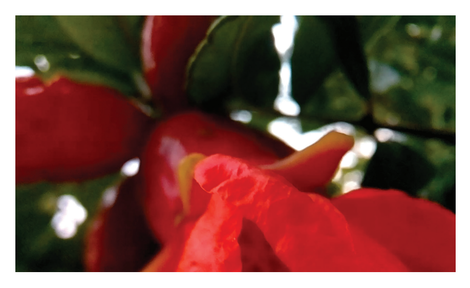
Figure 9. Garden Exercises (Haptic Visual Identities) Video. Quito 2017. Link to: http://www.cristianvillavicencio.net/43_gardenExercises.html

Link to: http://www.cristianvillavicencio.net/31_haptic_visual_identities.html