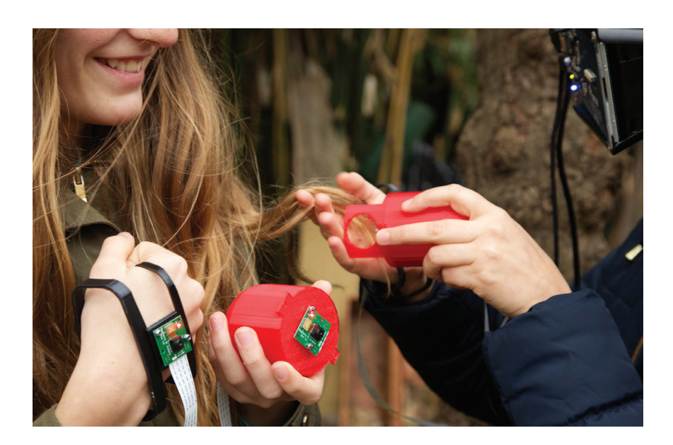
Figure 7. Still from Haptic Visual Identities Documentation Video. Bilbao - 2016 http://www.cristianvillavicencio.net/31_haptic_visual_identities.html