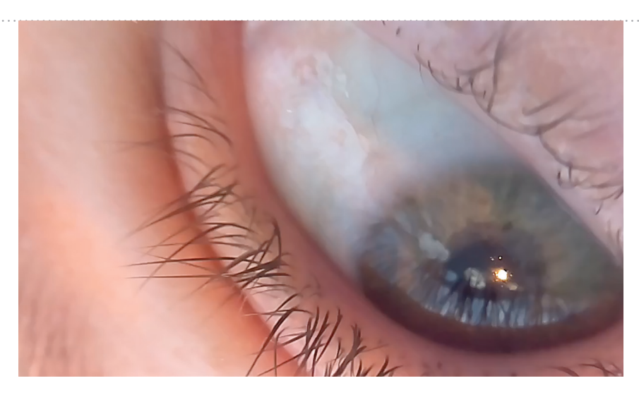
Figure 6. Berlin. (Haptic / Visual Identities) . Video. Berlin - 2016. http://www.cristianvillavicencio.net/31_haptic_visual_identities.html