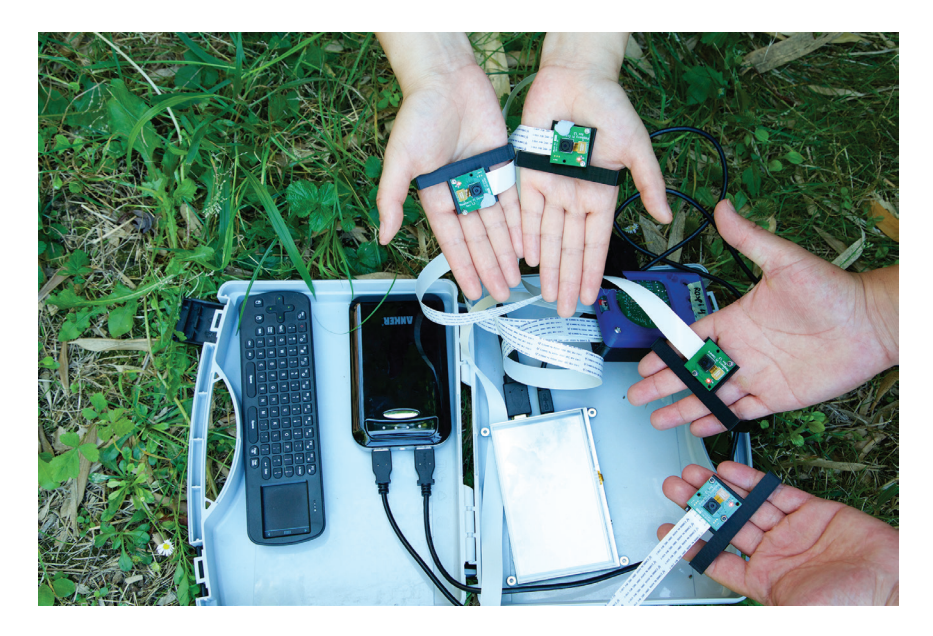
Figure 3, 4. Haptic cameras used in field recording.