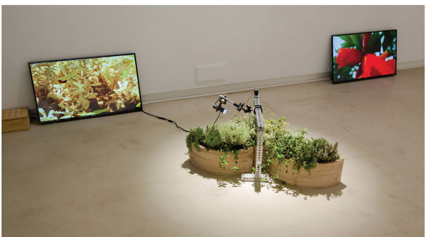
Figure 14. Garden Exercises Video. Quito. 2017. Jardín Mixed media. Bilbao 2017. Exhibited in Bilbaoarte in Bilbao, 2017.