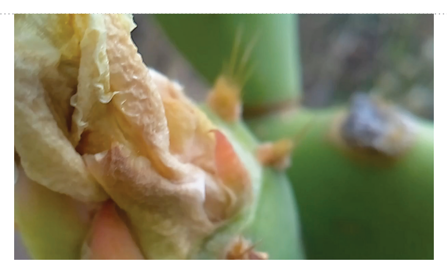
Figure 8. Portbou. (Haptic Visual Identities) Video. Portbou 2016. This video is a vision of Portbou (Catalonia) captured in random details of nature, cemetery and Walter Benjamin Memorial.

Link to: http://www.cristianvillavicencio.net/31_haptic_visual_identities.html